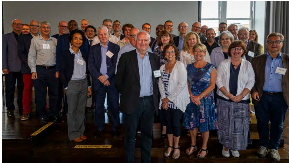
Organisation of News Ombudsman Conference, Columbia School of Journalism, June, 2019

While I did not ask about race or ethnicity, my experience within ONO since 2007 is that we remain largely a group of privileged white journalists. Indeed, the “class photo” from our 2019 annual conference, held at Columbia School of Journalism in New York, shows 33 white people in the group of 36 conference attendees.